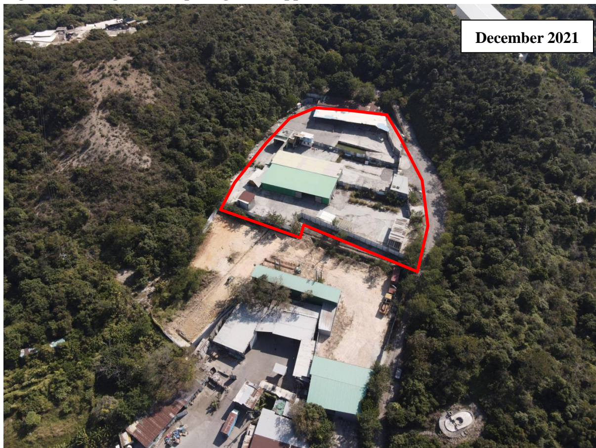
Figure 2 Existing concrete paving in the application site (marked in red)

電話 Tel.: (852) 2728 6781 傳真 Fax.: (852) 2728 5538 電子郵件 E-mail: cahk@cahk.org.hk