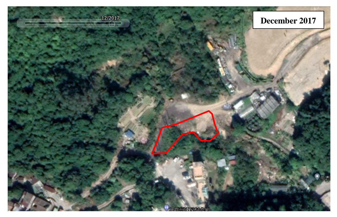
Figure 1 Vegetation clearance and land excavation could be spotted in the application site (marked in red)

電話 Tel.:(852)2728 6781 傳真 Fax.:(852)2728 5538 電子郵件 E-mail:cahk@cahk.org.hk